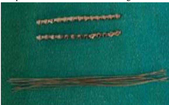
Fig 1. Erich arch bars

Various forms of arch bars have been delineated in the literature, including Sauer's arch bars, Schuchardt's arch bars, Dautrey's arch bars, Jelenko arch bars, Krupps arch bars, and Erich arch bars (EAB). Currently, Erich arch bars (Fig 1) are the most frequently utilized apparatus for achieving intermaxillary fixation due to the stability they confer. Intermaxillary fixation utilizing EAB is considered the gold standard as it facilitates superior occlusal stability in comparison to alternative methodologies 3 .