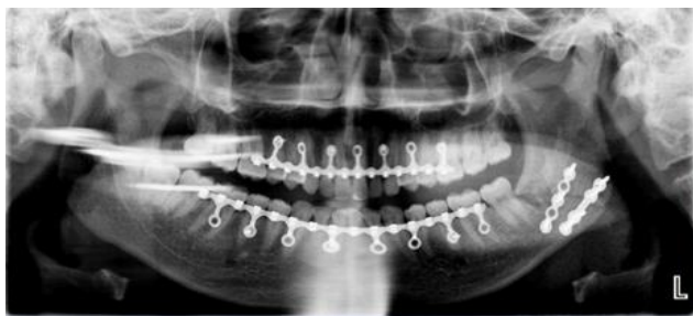
Fig 6. OPG showing fixation with Hybrid arch bars

We found that mucosal overgrowth may prolong the duration needed for arch bar removal, it does not lead to any undesirable clinical effects. 27 Proper utilization of the screw spacer instrument can mitigate the risk of mucosal migration over the screw. This instrument is positioned between the mucosa and the metal rim of the hole, lifting the metal rim away from the mucosa to prevent gingival compression and mucosal overgrowth. 27 Root fractures were assessed postoperatively using Orthopantomogram (OPG) in our study. While some patients showed root contact on OPG, (Fig 6) none exhibited symptoms of root injury or required endodontic treatment or extraction.