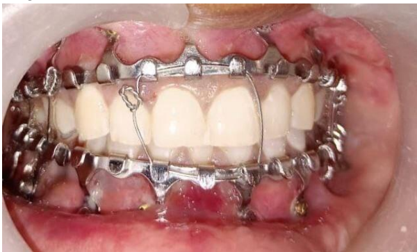
Fig 3. Placement of Hybrid arch bars

In group I, patients underwent IMF using placement of Hybrid arch bars fitted with eyelets for self-drilling screw fixation to the maxilla and mandible (Fig 3).