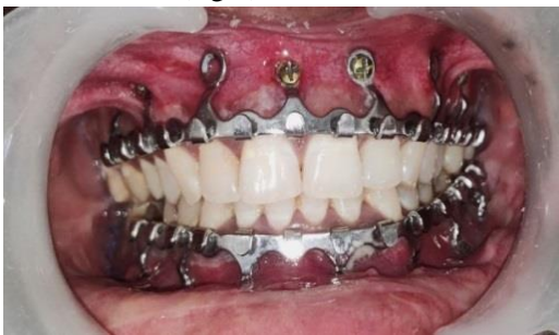
Fig 5. Mucosal over growth on Hybrid arch bar eyelets

Our analysis revealed that anterior screws achieved mucosal coverage more rapidly and consistently than posterior screws (fig.5).