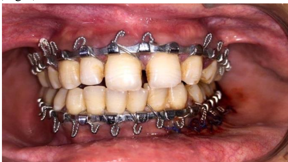
Fig 4. Placement of Erich bars

In group II, patients underwent IMF using placement of Erich arch bars secured with circum-dental wires (Fig 4).