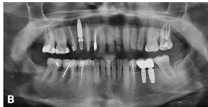
Figure 1. B – after surgical periodontal therapy and implant placement at the site of tooth N 14

implant was placed at the site of tooth N14 (Figure 1b).