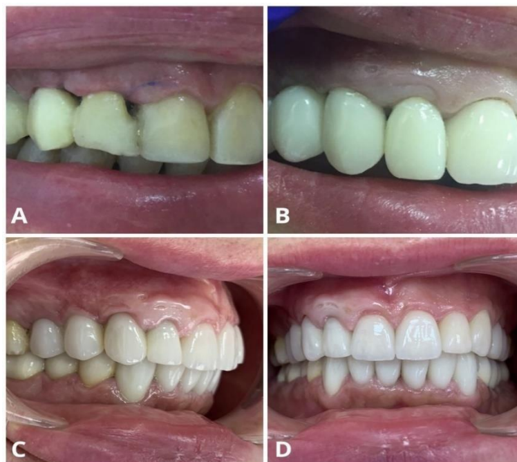
Figure 4. A – The situation two weeks after plastic surgery; B – the gingival recontouring with temporary crowns and bridges; C, D – the final crowns and bridges. Note the papillary volume between teeth NN 14-11

days, NSAID, first days – 2-3 times in a day, after in the case of pain. Chlorhexidine 0.12% mouth rinses were prescribed for 4 weeks. The postoperative period was without complications. The sutures were removed on the 10 th - 13 th day.