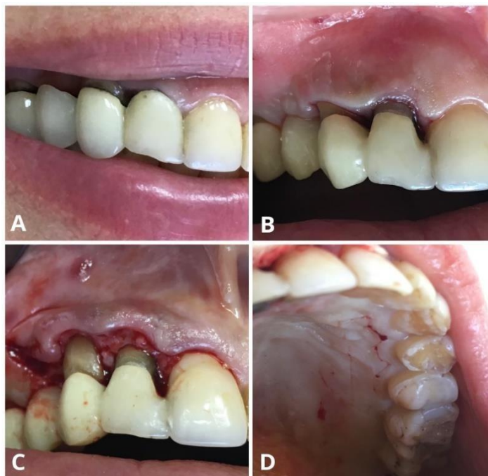
Figure 2. A - Black triangles are seen after initial periodontal therapy; B – black triangles are seen after surgical periodontal therapy; C – a split thickness flap with distal oblique incision is released; D – the modified, scalloped form of the free gingival graft (MFGG).

The free gingival graft (Figure 3a) was deepithelialised trying again not to overthin the peaks. The deepithelialised modified free gingival graft (DMFGG) was sutured so, that the edges of the flap (the peaks) were sutured with the palatal halves of the interdental papillae with polyglactin 6-0 (fig.3b).