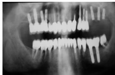
Figure 11. Radiograph after implant placement