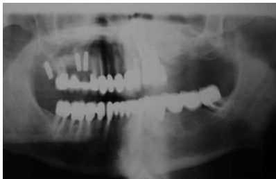
Figure 10. Postoperative radiograph after sinus lift