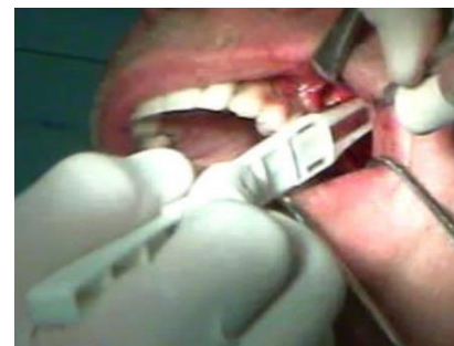
Figure 4. Insertion of Zimmer balloon in between the sinus membrane and the bony walls and inflating it with saline solution to detach the membrane from its bony walls