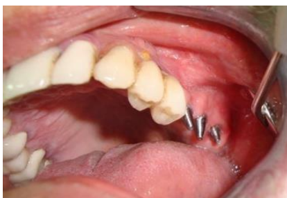
Figure 13. Intraoral view with abutments before fixation of the prosthetic construction