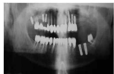
Figure 12. Final postoperative radiograph with restorations