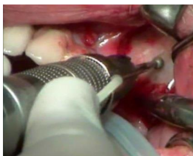
Figure 2. Bone scraper is used to collect autogenous bone from site of the operation

(usually \geq 11 mm) was achieved. The balloon was then slowly deflated and removed.