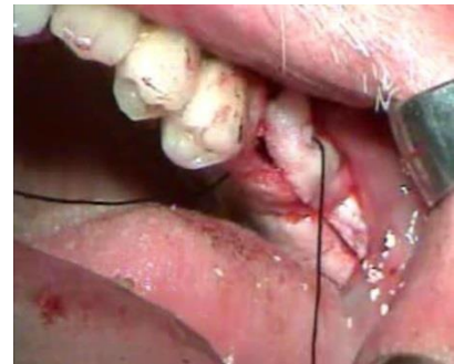
Figure 9. Suturing of the flap