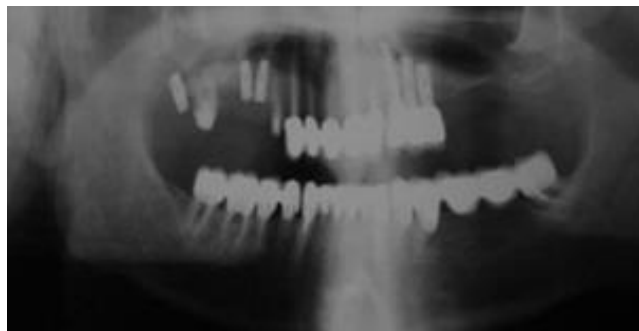
Figure 1. Preoperative radiograph

The study included patients in whom the location of the sinus floor from the crest was 3–5 mm, width \geq 5 mm (from the floor of the sinus to the crest of the bone, as determined radio graphically), a minimum follow-up period of 1-year loading.