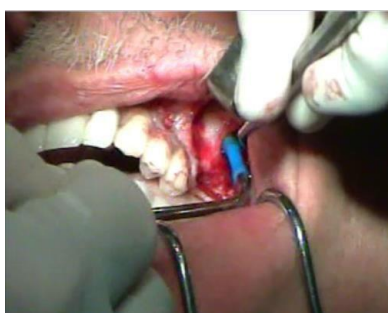
Figure 3. Opening a window on lateral wall of the maxillary sinus by round diamond bur