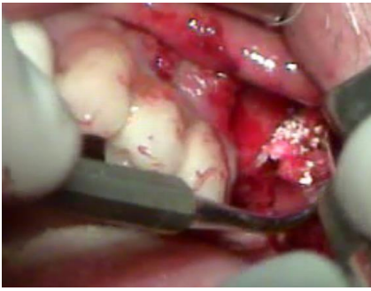
Figure 7. Augmentation of the sinus with bone graft and Platelet- Rich fibrin