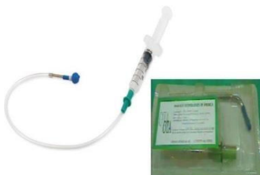
Figure 5: Zimmer balloon

Mixing the autogeneous bone which is collected from the site of the operation by a scraper with Cerasorb® (Curasan, German) crystals along with the patient's blood Platelet-Rich fibrin (Figure 6).