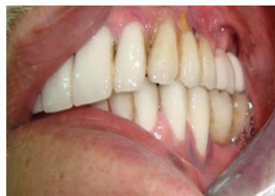
Figure 14. Final restoration with metal ceramic bridge

Implant placement was initiated 6 months post-operatively and reviewed at frequent intervals. Loading of the implants was carried out after 6 months. After removing the cover screw, healing plugs were installed and after 10 days the prosthetic stage of treatment was started (Figure 13, 14). All patients were evaluated radio- graphically after prosthetics (Figure 12) and 6th month, 1, 2, 3 years after prosthetics. The crestal bone height was maintained and verified by subsequent radiographs. In