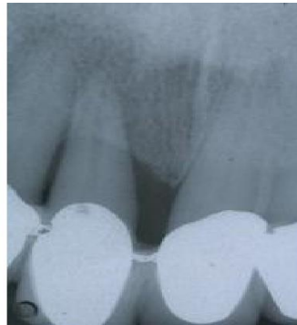
Figure 14. Intraoral periapical radiographic view 1 year later