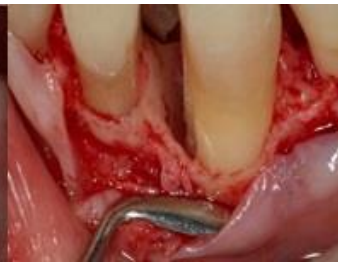
Figure 17. Reflection of flaps on the buccal and lingual for ideal visibility. Close attention to removal of all granulation was undertaken in the flap itself