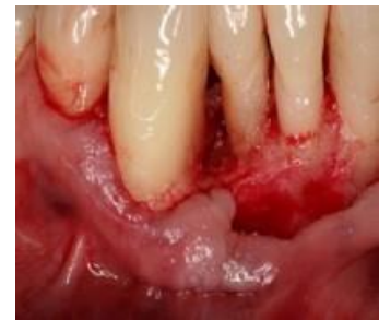
Figure 3. 10-year reentry shoed virtually no changes from 1-year photos