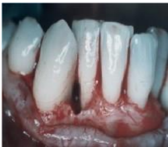
Figure 1. Day of surgery, intraosseous defect 7-8mm's with bone only present ob the buccal and lingual

Professional oral hygiene/maintenance procedures and reinforcement of oral hygiene instructions were performed during follow-up visits.