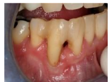
Figure 10. 24-month follow-up clinical view with no bleeding upon probing