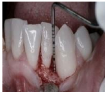
Figure 5. 1-year post surgery showed a material that appeared to be similar to bone. Fill appeared to be 95%