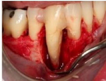
Figure 8. Application of standard protocol for treatment with EMD was undertaken. Endodontic treatment followed 6 weeks later