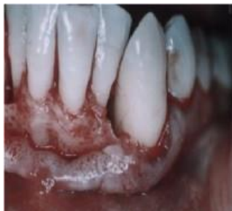
Figure 4. Day of surgery, intraosseous 6-8mm's with bone only present on the buccal and lingual of the defect