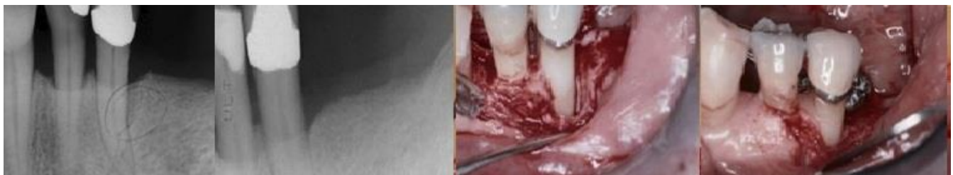
Figure 25. Distal defect of lower right second bicuspid to be treated

The patient presented with an intraosseous defects surrounding right lower second bicuspid.