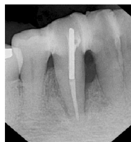
Figure 9. 24-months follow-up Intraoral periapical radiographic view