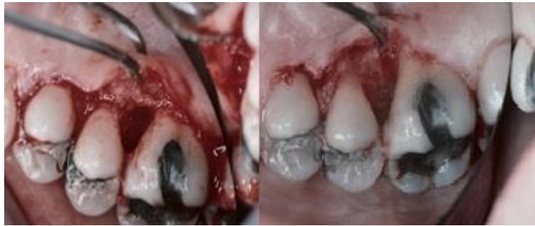
Figure 29. Deep defect between maxillary bicuspid and molar. EMD and freeze-dried demineralized bone placed in defect

The patient presented with an intraosseous defects surrounding between maxillary molar and bicuspid.