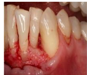
Figure 6. 10-year post surgery 0 changes occurred