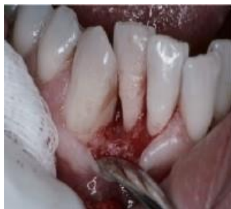
Figure 2. 1 year evaluation with a small incision to evaluate material present. 95% of the defect was filled with a material that resembled bone