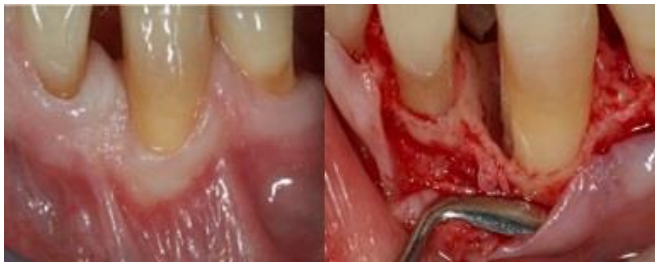
Figure 16. Lower left cuspid photo prior to entry for an attempt to eliminate deep pocket