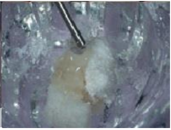
Figure 19. Bio-Oss collagen is impregnated with Emdogain and mixed thoroughly so all the material has EMD present