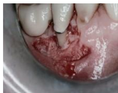
Figure 12. Reentry at 1 year show the original defect gone and a material that appears to be of the consistency of bone present. 95% of the defect was filled