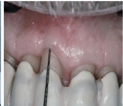
Figure 15. Probing at 1 year showed 1mm at best with adequate pressure placed. The patient continued with no real probings up to 8 years when he left the practice to return up north