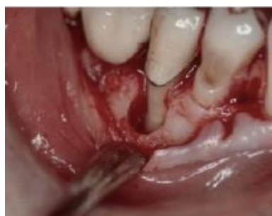
Figure 11. Intraoral periapical baseline radiographic view, bone loss as seen in right bicuspid tooth

periodontal therapy, then bone graft in intraosseous defects. The periodontal treatment protocol was the same as in all previous cases. After site preparation, the EMD gel was applied on the root surfaces and into the intrabony defect. A mixture of EMD and freeze-dried demineralized bone was then placed into the defect.