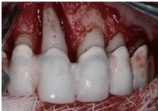
Figure 13. Intraosseous defects surrounding the apex 11 incisor tooth

which included initial conservative periodontal therapy, then bone plastic in the intraosseous defects. It was decided to splint the anterior teeth. The periodontal treatment protocol was the same as in the clinical case 1 patient: After site preparation, the EMD gel was applied on the root surfaces and into the intrabony defect. A mixture of EMD and freeze-dried demineralized bone was then placed into the defect.