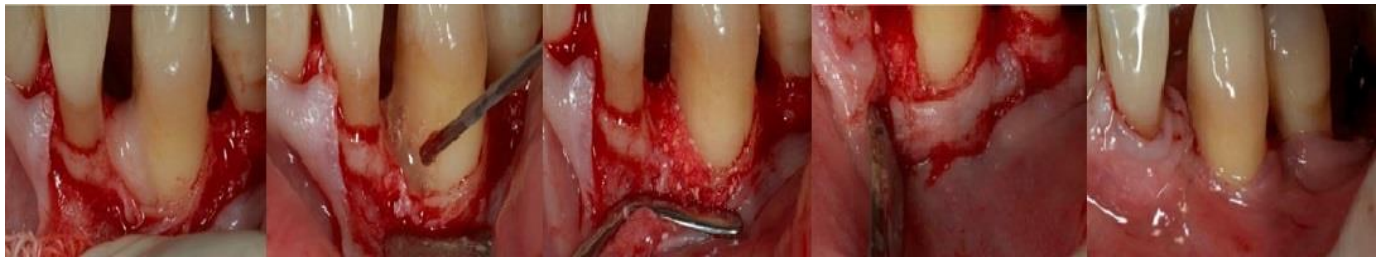
Figure 20. Prefgel (EDTA) was used to remove the smear layer. Prefgel was part of the Emdogain protocol. I also used 38% Phosphoric acid for 15 seconds as an alternative to Prefgel