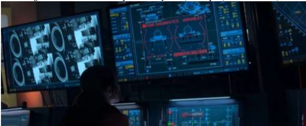
Figure 2. The circular room of the military base (Interceptor, 1:02:30 minute)

The Maritime Influence of the US Army is also communicated through the montage cut technique. In the scene spanning from 48:46 - 48:59, comprised of 7 consecutive short shots, there is a rapid succession of the fight scene, the button launching the missiles, the tracking system for the launched nuclear missile, the same scene as seen from closer and farther away, with scenes alternating between wider and closer perspectives, including a close-up shot of the "LAUNCH" button. Such a combination of combat operations and countdown serves to underscore the critical nature of the situation, creating a palpable sense of urgency and the imperative for immediate action. The US Army, equipped with powerful weaponry, stands prepared to swiftly neutralize a missile launched from Russia, safeguarding the world from a nuclear threat. Shots